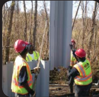
Davis Pond 2nd Enlargement