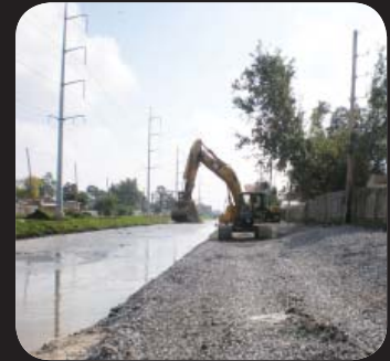
Canal #17 Bank Stabilization, Jeff. Parish